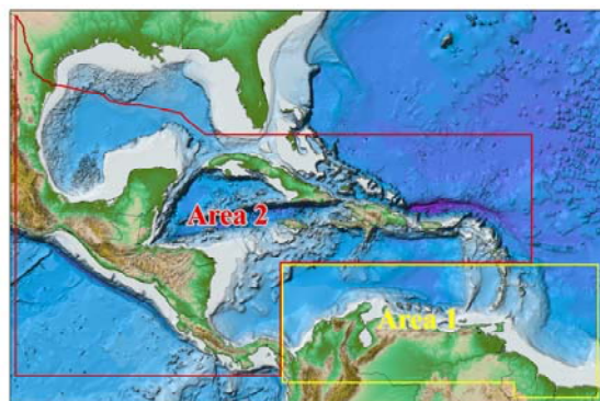
Figure 1. Area 1 outlined in yellow. Area 2 outlined in red. Phase I focused only on Area 1. Phase II will include Area 1 and 2.

Scope of CBTH Phase II. Our plan is to continue work in the Phase I area, as well as, the new Phase II area. We recognize that many of our sponsors are heavily linked to the Phase I area of Trinidad, Venezuela, Colombia, Suriname, and Guyana and for this reason it will continue to be a priority of study for the 2008-2011 period. In order to avoid confusion, we are renaming the areas, Areas 1 and 2, rather than Phase I and II which has a time connotation. So, for the 2008-2011 second period or phase of this study, we will be working in both areas 1 and 2 as shown in Figure 1.