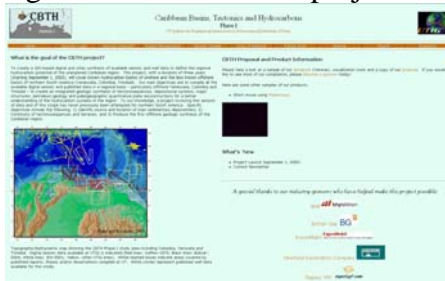
Figure 2. CBTH Home Page

www.ig.utexas.edu/research/project/cbth/