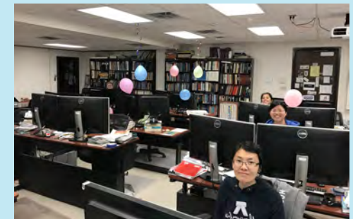
The CBTH computer lab at UH

Numbers on the map refer to areas of proposed work described in the text of the Phase IV proposal (revised in 2015): 1 = USA and Mexican Gulf of Mexico; 2 = Florida and Bahamas region; 3 = East Coast of the USA (conjugate rifted margin of NW Africa); 4 = Nicaraguan Rise in Jamaica, Honduras, Nicaragua, and Panama; 5 = Deepwater areas of Colombian and Venezuelan basins; 6 = Panama accretionary prism; 7 = Onland basins of Colombia; 8 = Pacific margin basins of Colombia, Ecuador and Peru; 9 = Foreland basins of Peru and Ecuador; 10 = Llanos foreland basin of Colombia; 11 = Venezuelan foreland basins; 12 = Trinidad, Barbados, and Barbados accretionary prism; 13 = Northeastern South America in Guyana, Suriname, and Brazil (conjugate rifted margin of Equatorial Africa); 14 = Southern Brazil and Uruguay (conjugate rifted margin of southwest Africa); 15 = Northwest margin of Africa; 16 = Equatorial margin of Africa; 17 = East African margin.